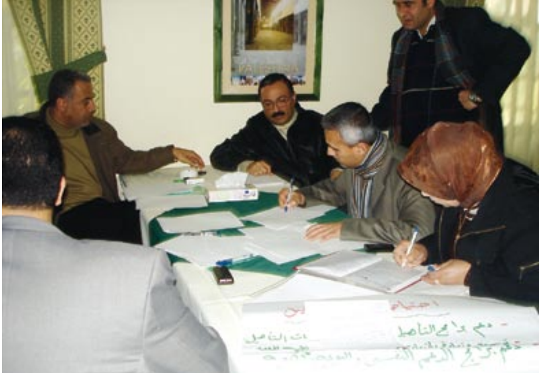
NGOs Working Group for Community Rehabilitation Sector