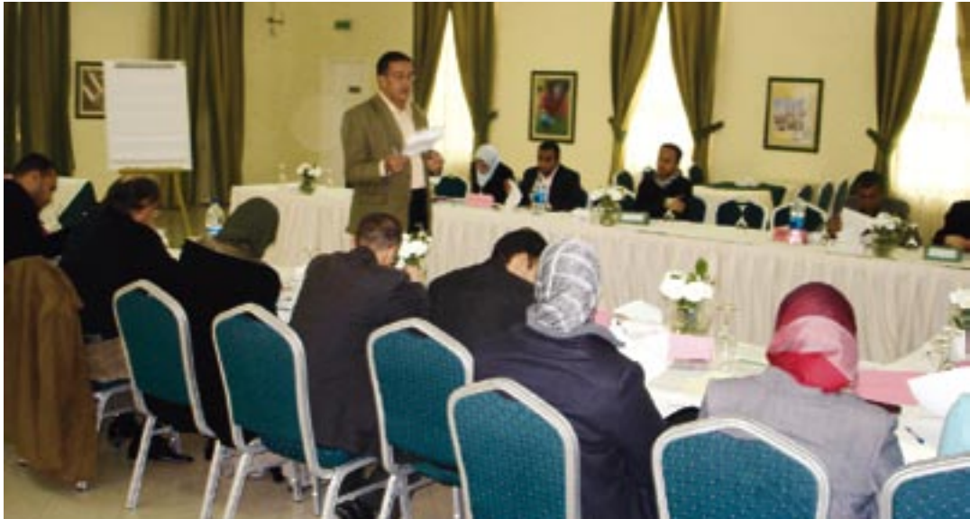
External Facilitator wraps up the Focus Group Work on Psychosocial Sector