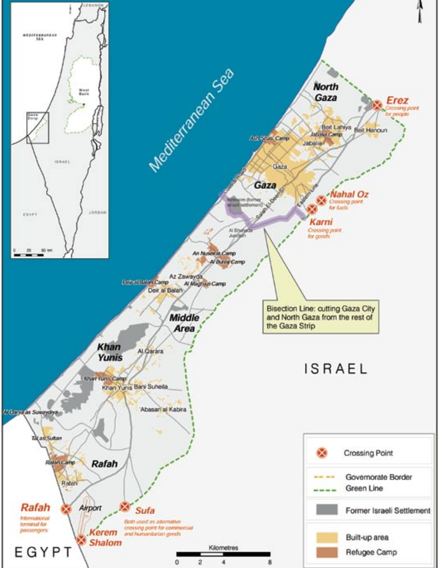
MAP 2 (Bisection of the Gaza Strip)