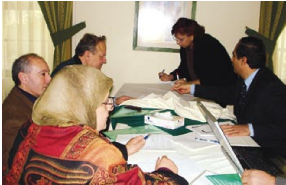
NGOs Working Group for Health Sector