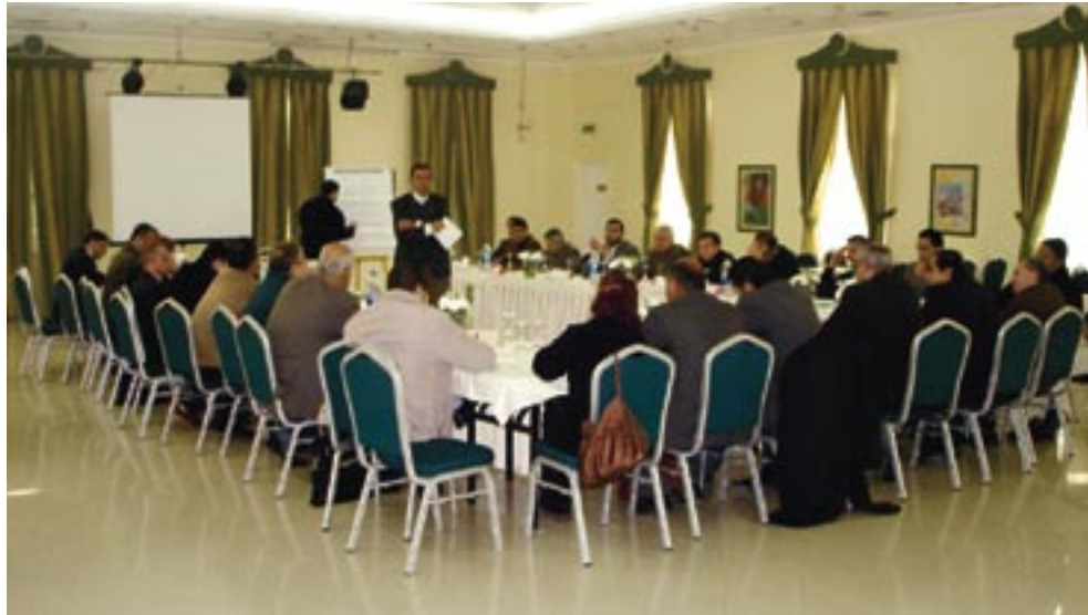
Representatives of Health, Community Rehabilitation and Agriculture NGOs